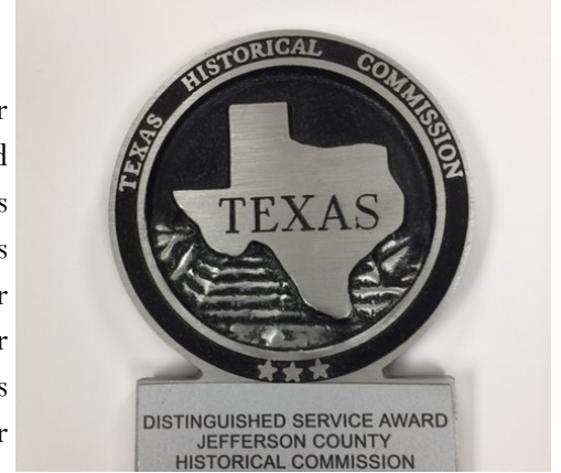
2018 Distinguished Service Award

Congratulations to our JCHC members for earning our 37th Distinguished Service Award from the Texas Historical Commission! This award is presented in recognition of JCHC's dedication to historical preservation. Our members contributed over 3100 volunteer hours in 2018, working on many projects including our first ever historical calendar published for 2019.