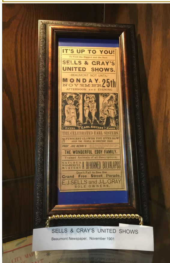
Flyer advertising Sells & Cray's United Shows, 1901