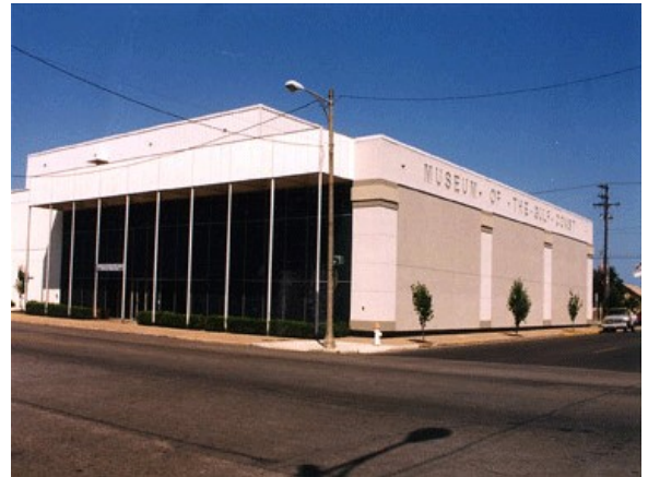
Museum of the Gulf Coast