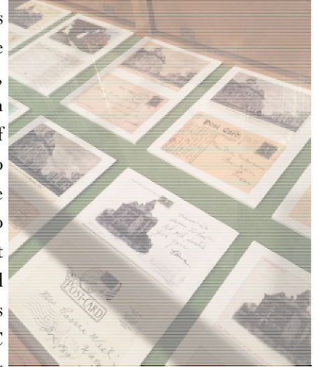
Mini-museum Exhibit of Postcards of 1893 Courthouse by Steven Lewis