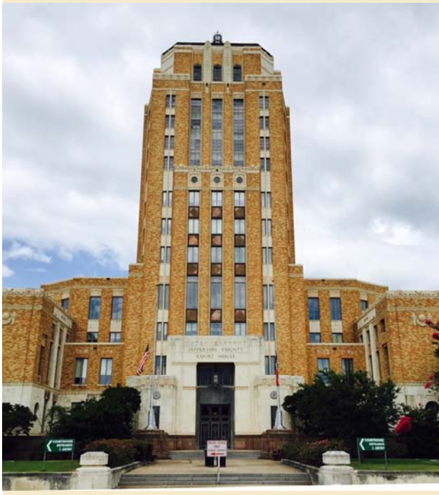
1931 Jefferson County Courthouse