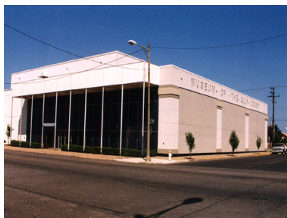
Museum of the Gulf Coast