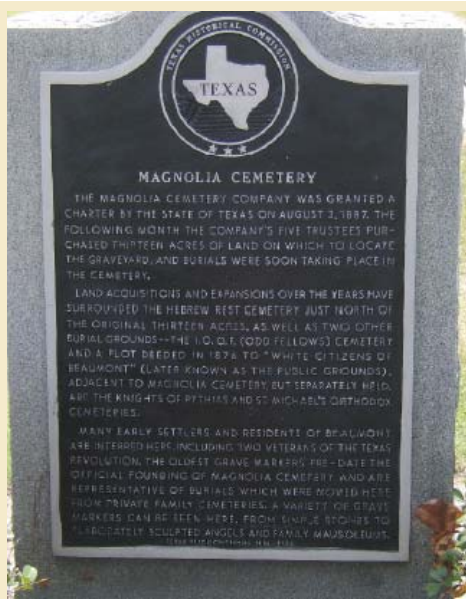
Magnolia Cemetery Historical Marker