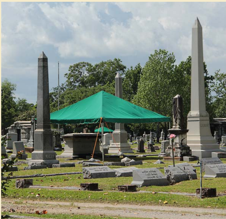
Magnolia Cemetery Tour

The full Cemetery tour is slated once again for early October. More details are coming soon.