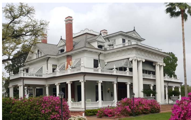
McFaddin-Ward House Museum