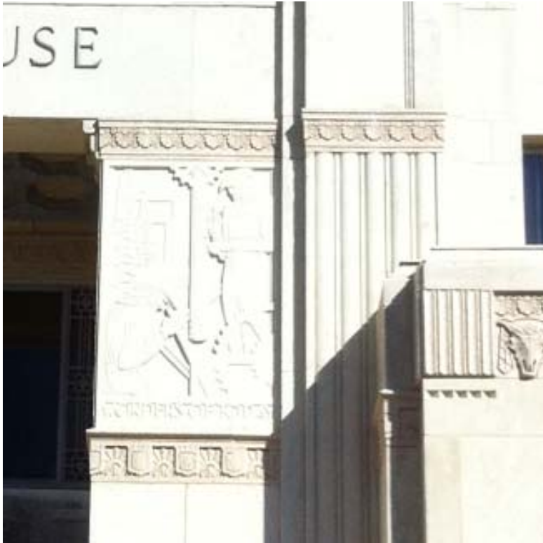
Front Entrance Jefferson County Courthouse