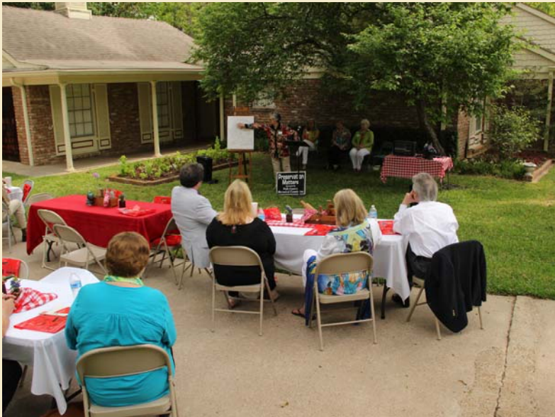
CHC Regional Meeting in Polk County