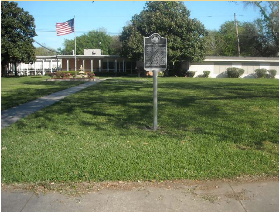
Community Retirement Home

Community Retirement Home in Port Arthur held a marker dedication ceremony on Thursday, April 24, 2014. The Community Retirement Home dates to 1944 when it was opened on Proctor Street in the former Model Apartment Building. The Board was comprised of members of the Federated Mission Society from several local churches.