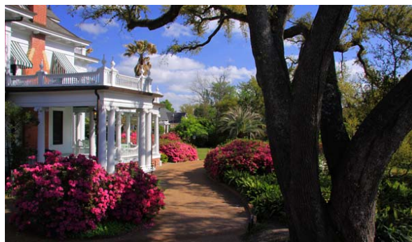
McFaddin Ward House

The McFaddins collected a lot over their years spent in the house, including many pieces destined for the two dining areas of the home. If you've visited the museum, you've seen examples of these lavish tablescapes, often set with exquisite pieces of china, silver, cut glass, and others. A new exhibit at the McFaddin-Ward House Museum's Visitor Center is showcasing a few items that brought color and playfulness to these elegant table settings. "Lively Tableware" features food-themed serving pieces from a variety of countries, including Japan, Czechoslovakia, Italy, and the United States.