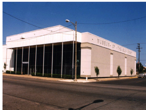
Museum of the Gulf Coast