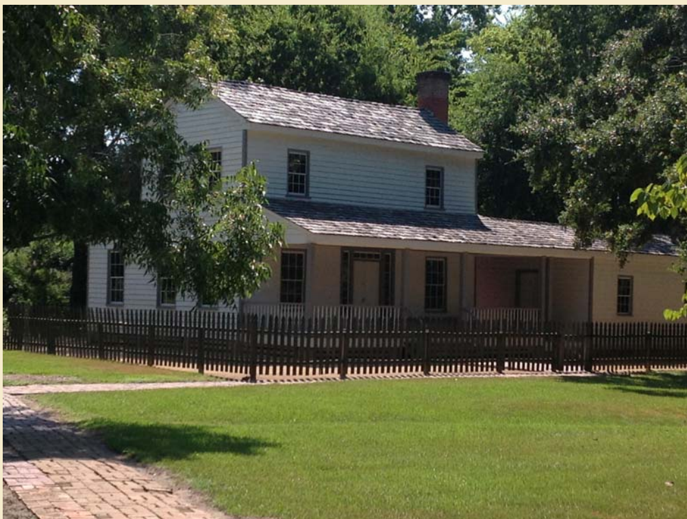
John Jay French Museum

For more information, www.beaumontheritage.org