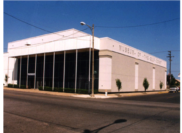
Museum of the Gulf Coast

More than sixty musicians are featured in the Museum's Music Hall of Fame. The rich cultural crossroads of the Gulf Coast has created a unique mix of musical talent representing nearly every genre including rock, blues, soul, pop, western swing, jazz and country.