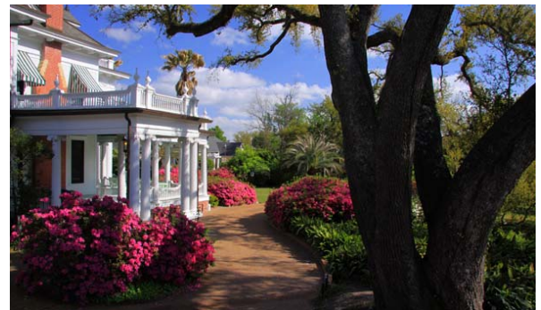
McFaddin Ward House

The McFaddin-Ward House and LoveYoga are excited to bring you Mondays at the Museum. The McFaddin-Ward House will open up its lawn on the last Monday of the month for a little bit of yoga and a lot of scenic surroundings. Join us on the east lawn of the museum for a donation-based session. It all starts at 6:45 pm!