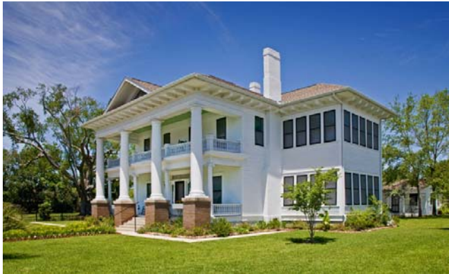
Chambers House