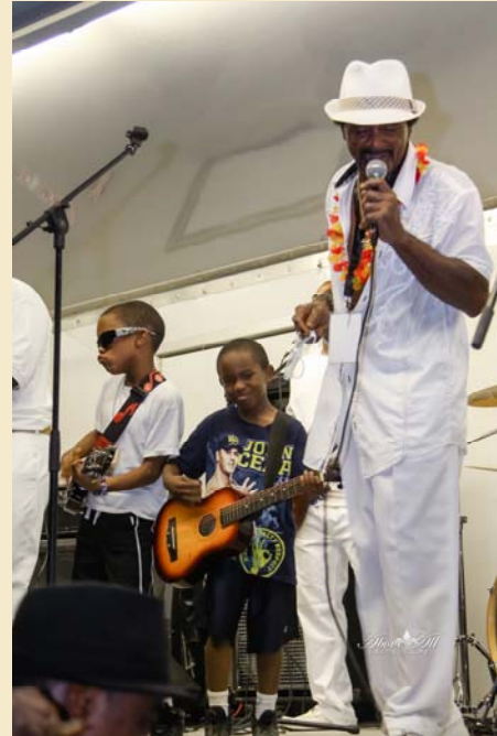
City of Beaumont Juneteenth Celebration in Tyrrell Park